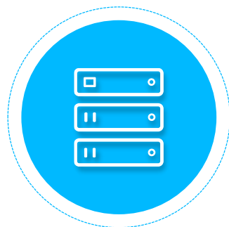
Solution - 2h Personalized for each team