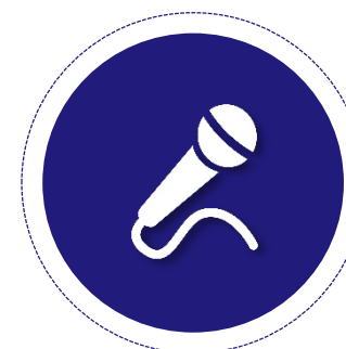
Pitch training - 2h Workshop