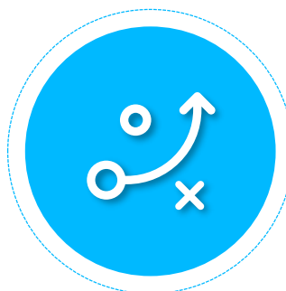
Business model - 2h Personalized for each team